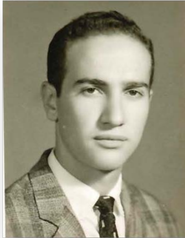
High school years

1967-70: Ph.D. in Physiology (Neuroscience), University of California, Berkeley.